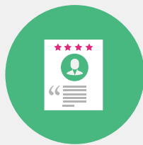
ENHANCED ONLINE PROFILES