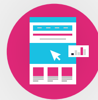
BEAUTIFUL, ROBUST WEBSITE